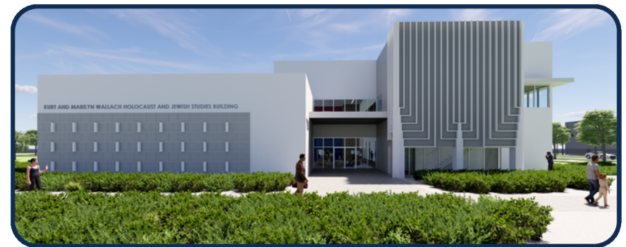
Kurt and Marilyn Wallach Holocaust and Jewish Studies Building

Mission Statement: The Gutterman Family Center for Holocaust and Human Rights Education was established in 1996 to prepare school district professionals and support staff to implement Florida Statute 1003:42: Required Instruction of the Holocaust, by providing professional learning opportunities. As generations of Holocaust survivors are no longer able to tell their stories, education is more important than ever. The Gutterman Family Center provides direct services to educators in Southeastern Florida by teaching the history of the Holocaust to combat prejudice, hatred and indifference; to apply the lessons of the Holocaust to understand the consequences of prejudice and bigotry; to identify behaviors that discriminate against people; to know when and how to act on behalf of others whether we know them or not; and to become active citizens who are able to uphold the dignity of all people.