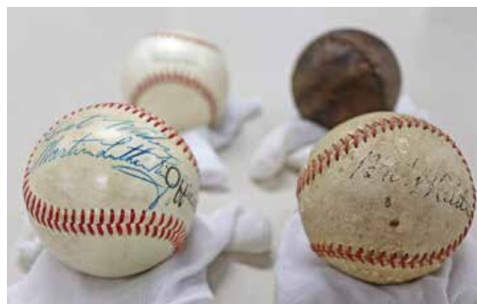
A look at some of the signed baseballs that will be on display at FAU by the end of the year in a new donated exhibit.

Some highlights of the memorabilia on display will include: