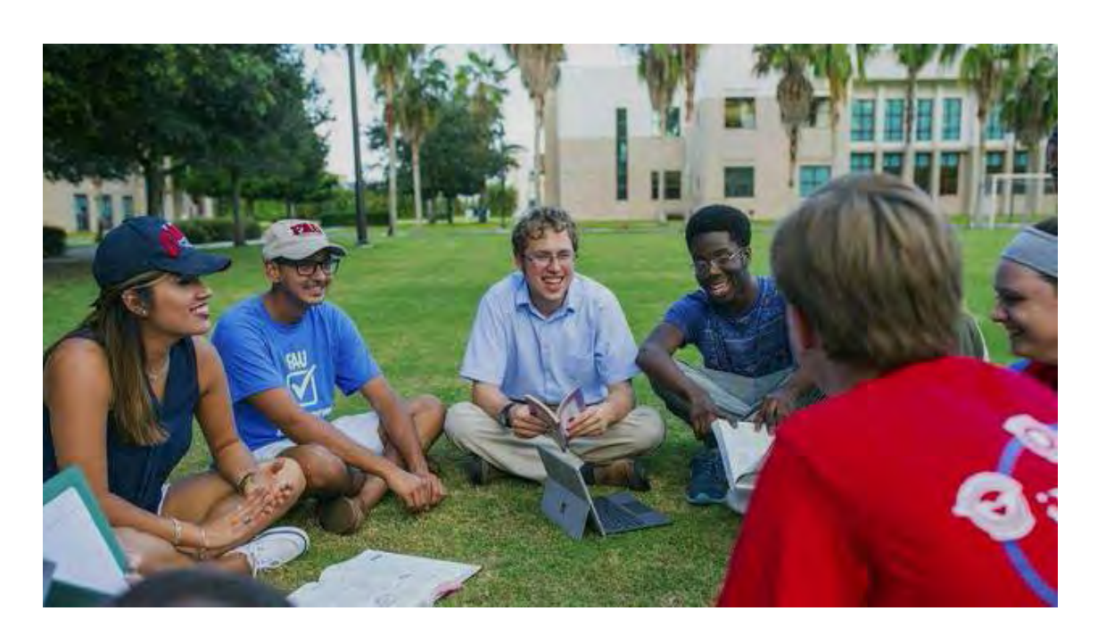
Annual Report of Activities Fiscal Year Ended June 30, 2017