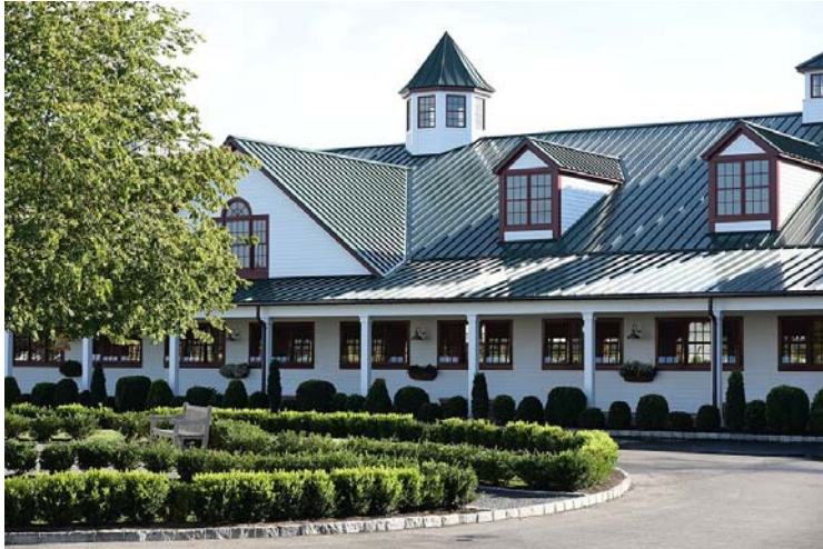
Campbell Stables.