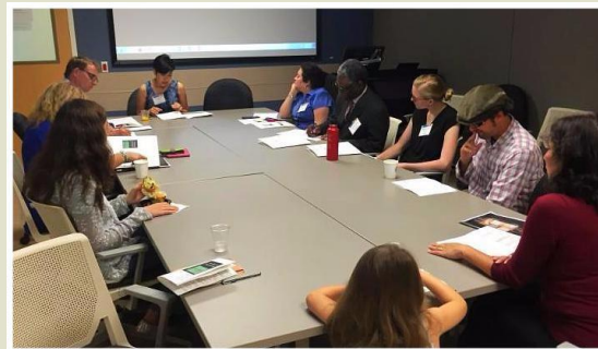
Panelists engage in thoughtful round-table discussion