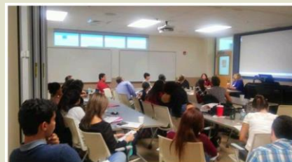
CSSA Conference Spring 2016

We would first like to thank everyone who participated in last year's CSSA Conference: Crossings & Intersections . The conference was a great success! We are already looking forward to our Spring 2017 CSSA symposium. The symposium will focus on Humanities and Social Justice, and will coincide With Angela Davis' visit in Spring of